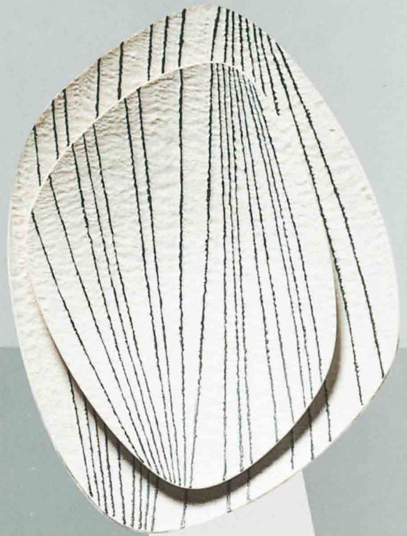
CT-2003 H CT-2003 HS